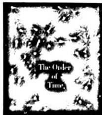
New from Carlo Rovelli